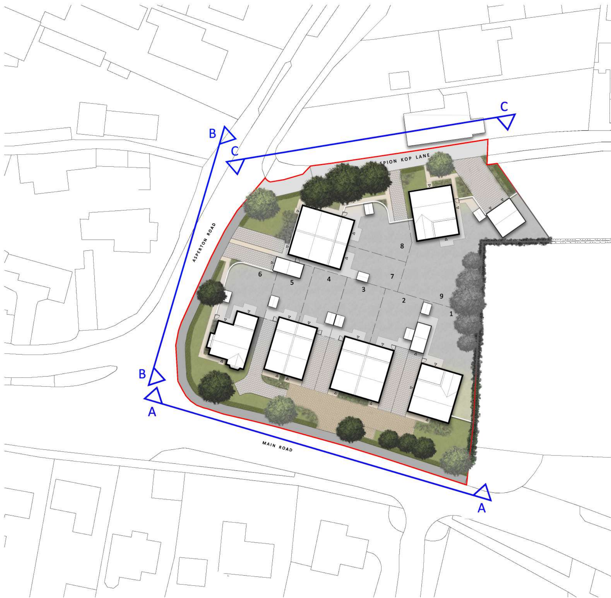
LOCATOR PLAN (1:500)