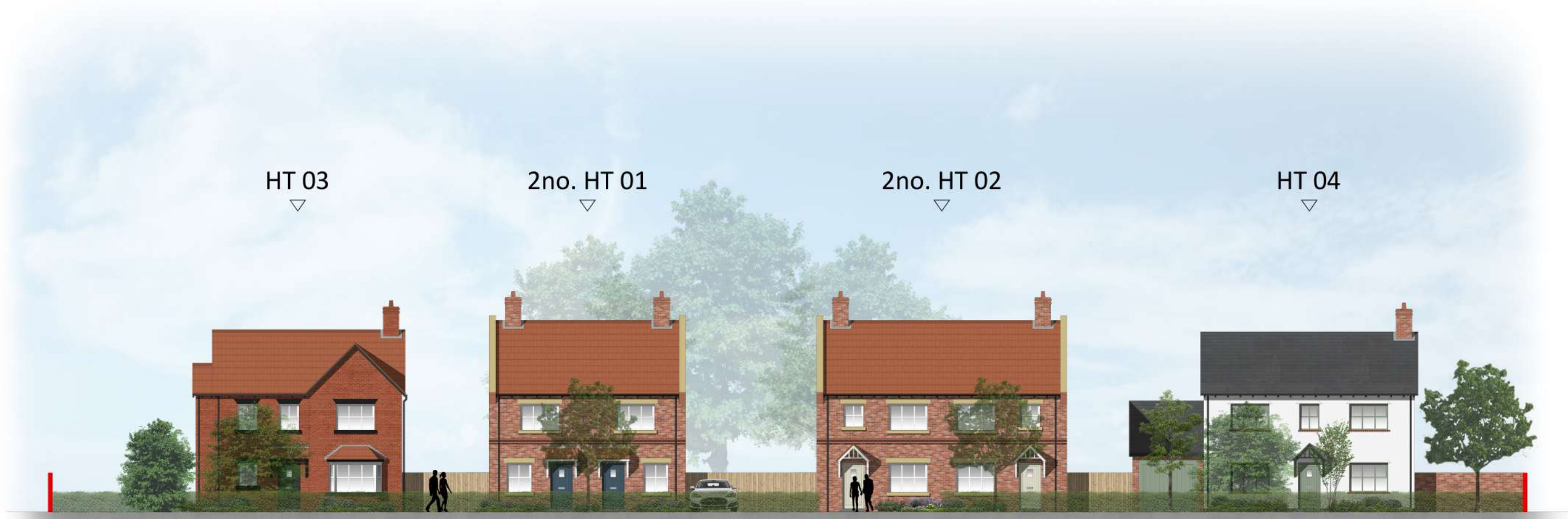
STREET SCENE A-A (1:200)